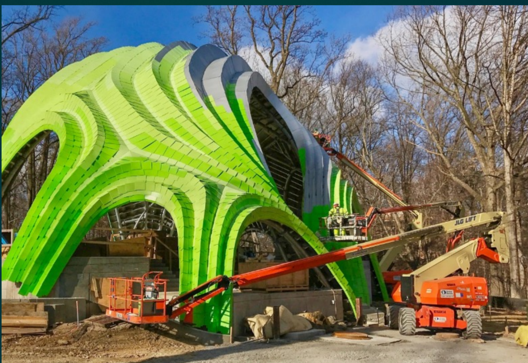
Chrysalis Stage Pavilion Sculpture in Merriweather Park.

“Beyond being in nature, the Chrysalis in Merriweather Park at Symphony Woods is of nature.”