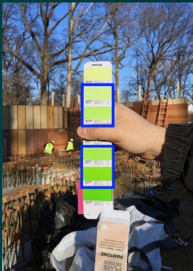
Inner Arbor Trust selection of four paint swatches for the Chrysalis.

In the summer of 2013, the Inner Arbor Trust established its brand mark and the green color palette for the Chrysalis, the first phase development in Merriweather Park at Symphony Woods. Designed to both stand out as well as blend into its surrounding nature environment, the Chrysalis Stage Pavilion will provide a flexible performance space for the Columbia, Maryland community.