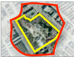
Scale Reference: Tivoli Gardens, Copenhagen in Merriweather Park