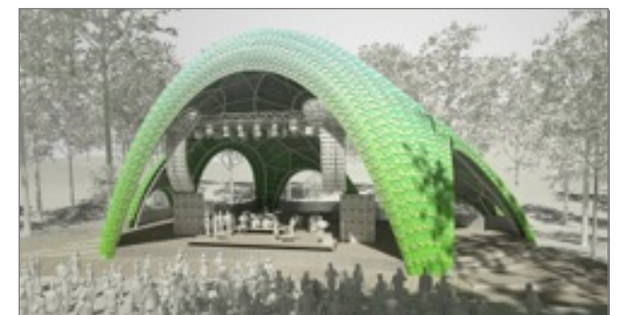
The Chrysalis amphitheater