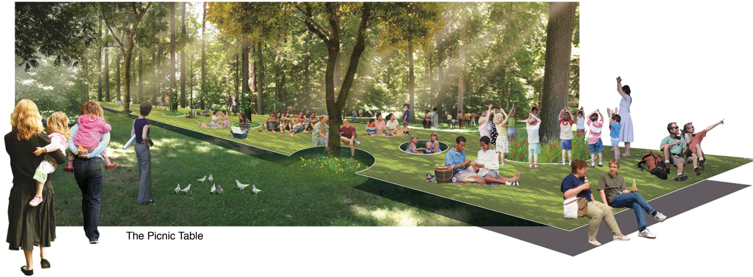
The Picnic Table