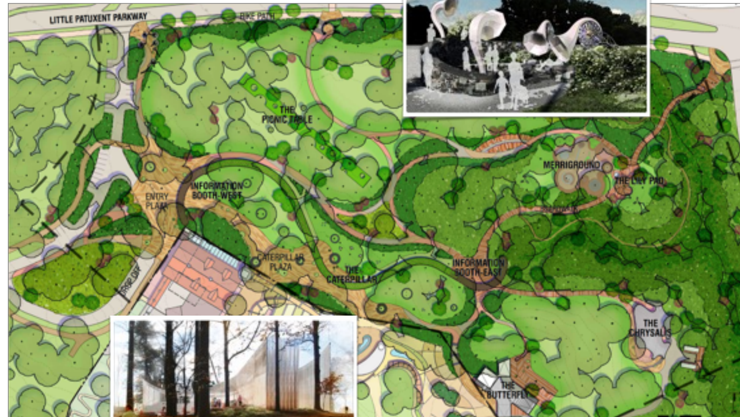
Song Cycles entrance