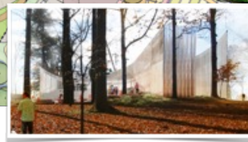
The Butterfly guest services building

"Unique and beautiful places foster social interaction and boost economic development. They attract new talent and vitality. Merriweather Park at Symphony Woods will do that and more."