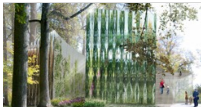
The Butterfly guest services building