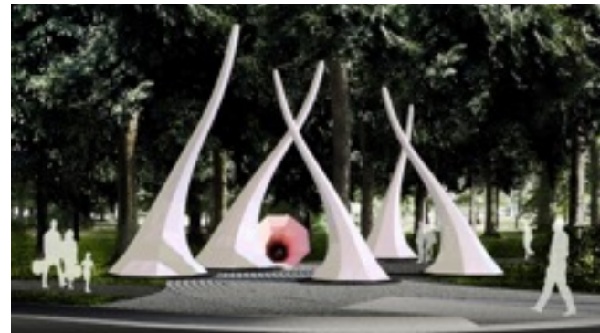
Land Horns entrance