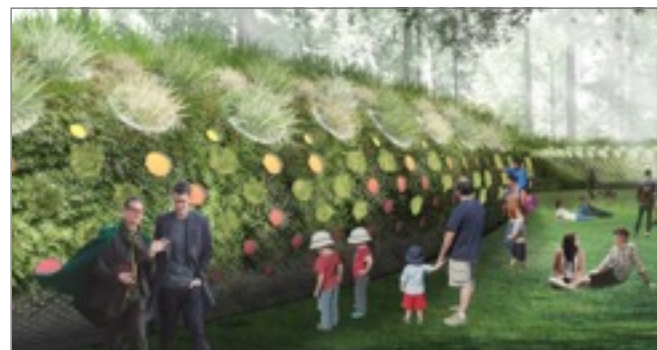
The Caterpillar "art of bounds"