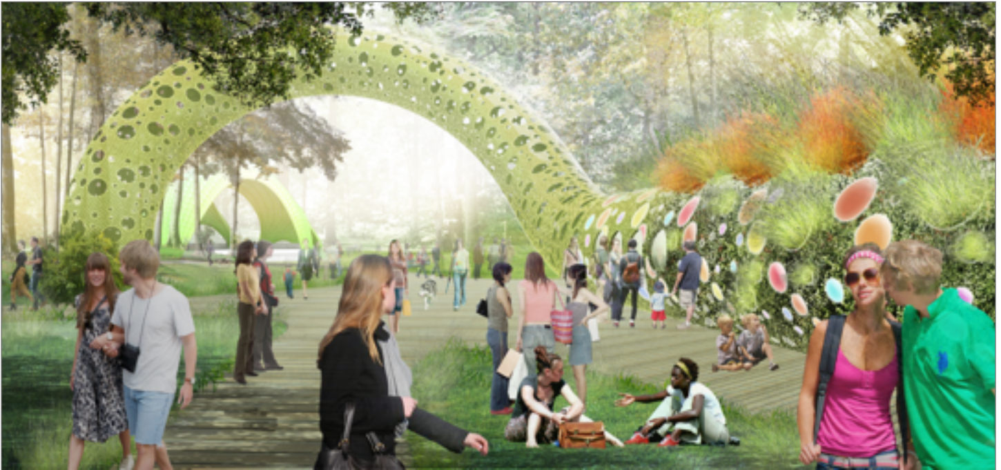
The Chrysalis amphitheater beyond, framed by The Caterpillar